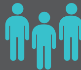
BIG BROTHERS BIG SISTERS

87% HAVE STRONG SOCIAL NETWORKS 50% MORE LIKELY TO VOLUNTEER (AND GIVE 30% MORE TIME!) 13% MORE LIKELY TO DONATE (AND GIVE 20% MORE MONEY!)